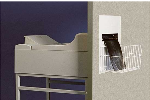
FI-75 shown installed for thru-the-wall use