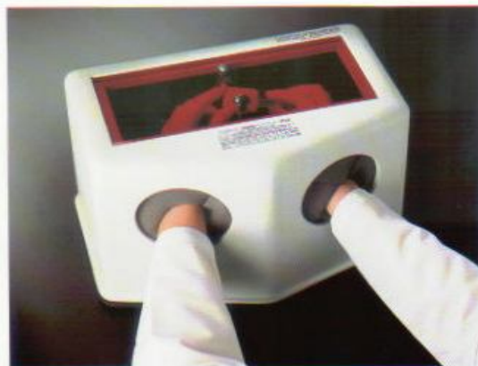
Complete processing of intraoral film, from removal of film jacket to final rinse, is performed within the light-tight unit. Top viewing panel lifts back for removal of processed film.